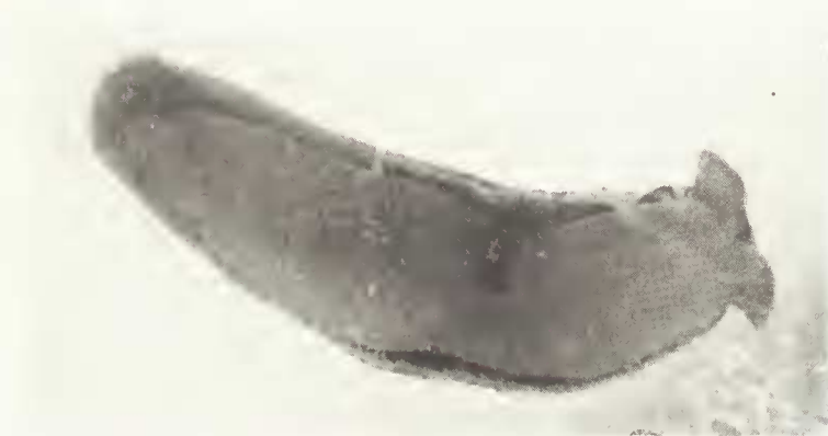
Onchidina australis Semper. Wingan Inlet, Victoria. Ventral view x 1\frac{1}{2} .